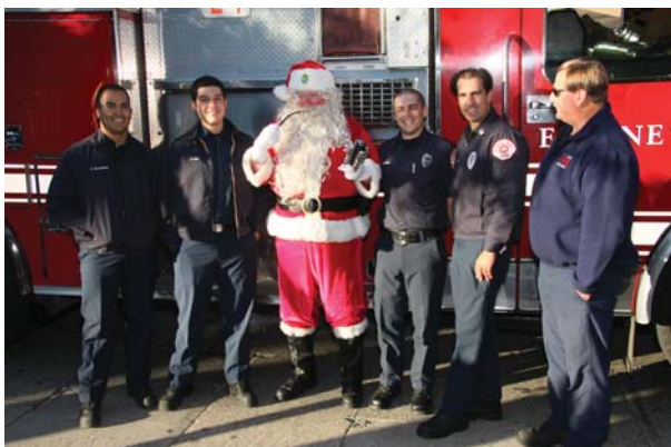
Santa and his "elves" pose in front of the "sleigh".