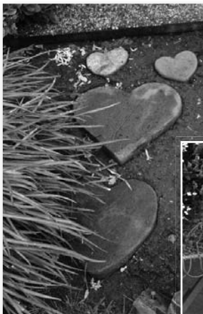
The Simons' charming garden is filled with thoughtful and exquisite details.