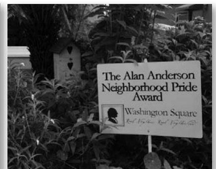
The Award sign in the front garden looks like it's been there forever.