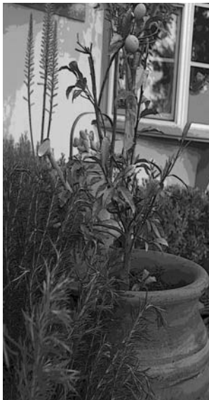
Plantings and garden elements are arranged with a careful eye to color and composition.

You'll find more of their story and additional photos on the website at www.washington-square.org . We urge you to share their renovation adventures.