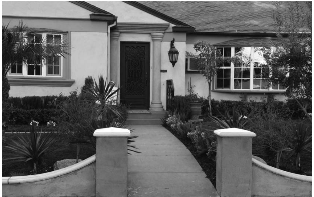
Lush landscape design beckons and welcomes visitors. You are surrounded by flowers in bloom as you walk from the sidewalk to the front door.