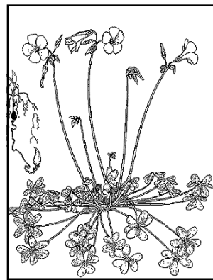
Please note: Oxalis

So neighbors, the weedy oxalis is flourishing now and is not to be confused with, you guessed it, snapdragons.